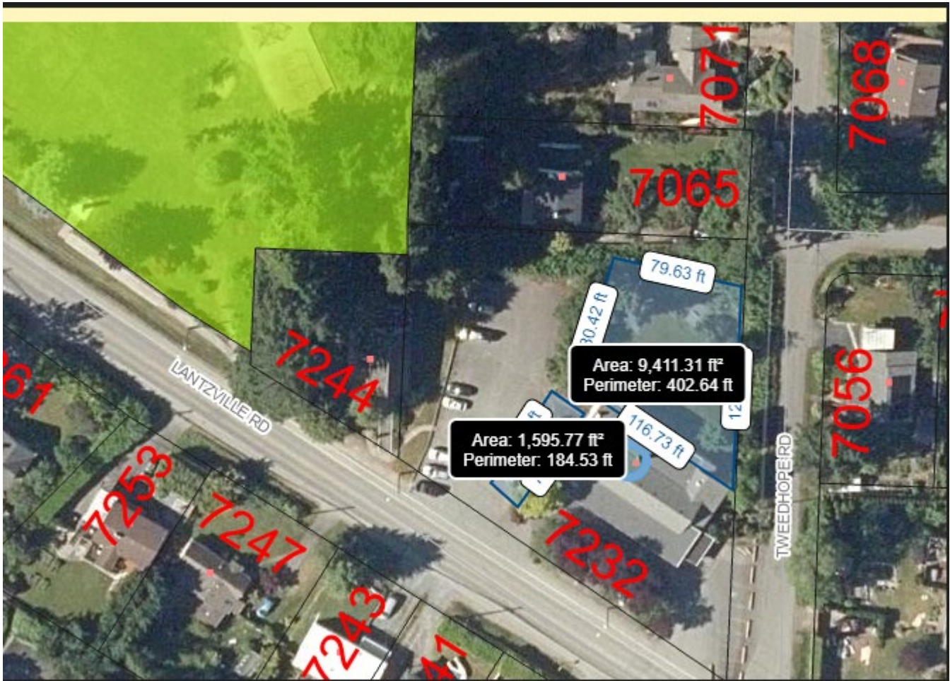
Yard and public parking used by Amelia House Playhouse at 7232 Lantzville Rd